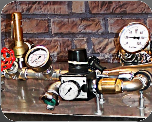
Digital temperature control