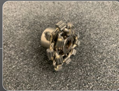
Chain scraper CYCLONE