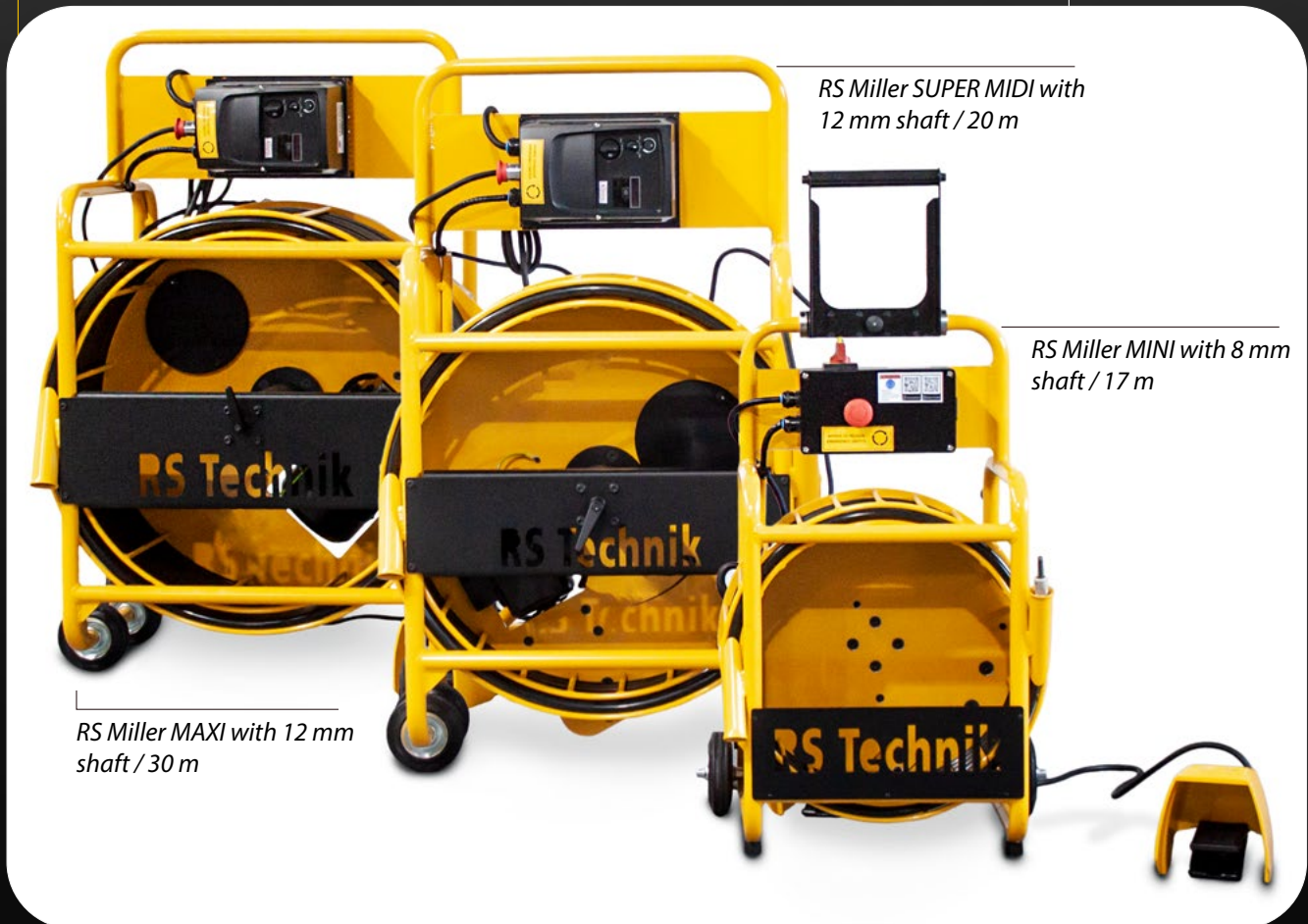
RS Miller SUPER MIDI with 12 mm shaft / 20 m