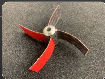
4-panel SANDING PANEL