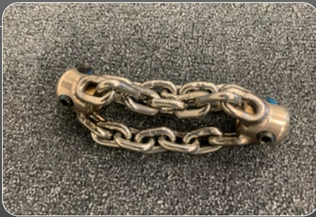
Chain scraper CLASSIC