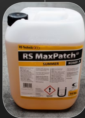
RS MaxPatch ® Komp. A Summer