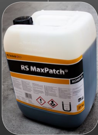
RS MaxPatch® Komp. B