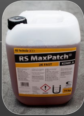
RS MaxPatch ® Komp. A 2K Fast