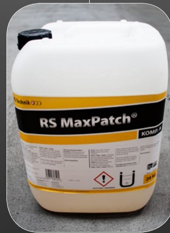
RS MaxPatch® Komp. A