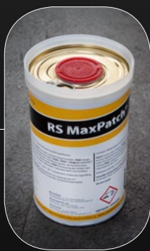
RS MaxPatch ® Komp. C