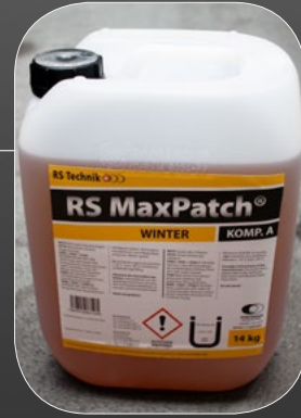
RS MaxPatch ® Komp. A Winter