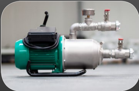
Water circulating pump