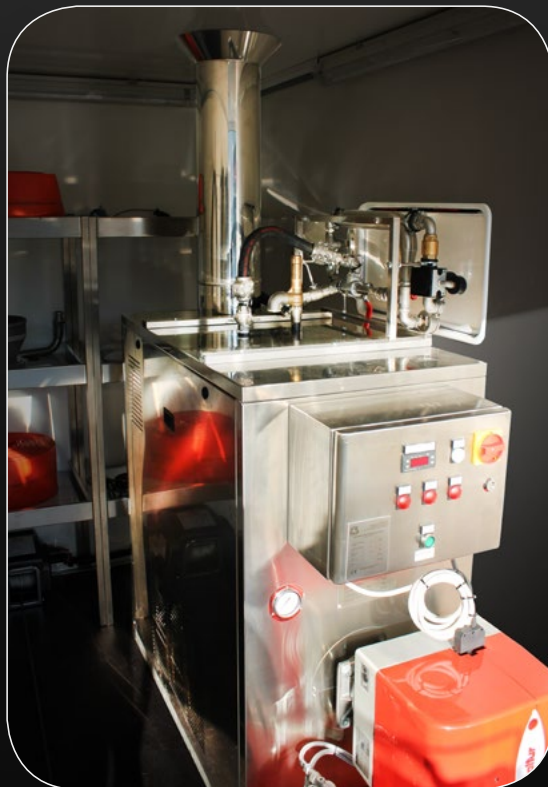
Steam Unit 150

Edging profiles at door opening and rain bar above the door